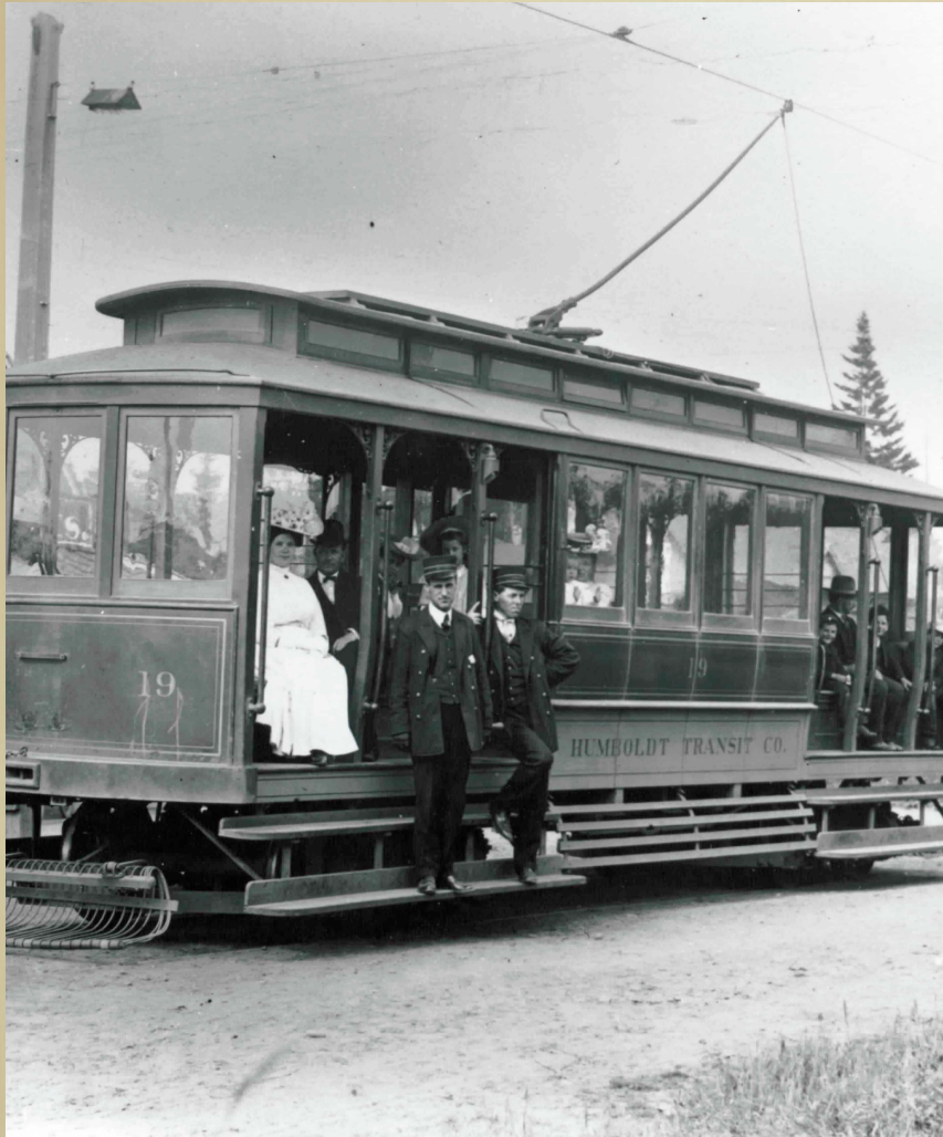
PRIVATE STREETCAR COMPANIES 1800s vs 1900s